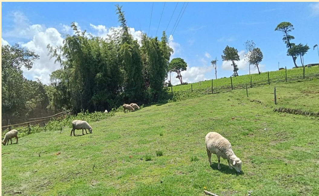
Figure1. 4: Livestock Grazing on Land Previously Under Bamboo

In addition, 37.4% of respondents agreed and another 45.2% strongly agreed that commercial farming posed a serious threat to the environment, while 7.1% remained neutral and 10.3% disagreed with the statement. These results indicate a strong perception by the community members that commercial farming is one of the sources of environmental degradation, perhaps through deforestation, over utilization of water sources, and excessive exploitation of agrochemicals. Concerns relating to these issues have also been reported in Kenya and other regions of sub-Saharan Africa where massive commercial agriculture ventures have been the cause of land degradation, a decline in biodiversity, and a decreased supply of ecosystem services (Kogo et al., 2020; Njeru et al., 2021). In that regard, Kogo et al. (2020) mention that the rate of soil