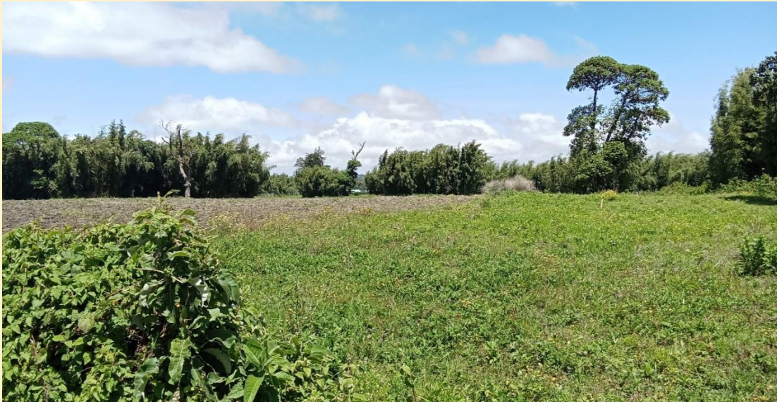
Figure 1.3: Newly Encroached Land

Moreover, 116 (74.9%) of the respondents agreed that increased grazing livestock have a negative impact on bamboo forests, while 29 (18.7%) were neutral on the statement and 10 (6.5%) disagreed with the same statement that increased grazing livestock have a negative impact on bamboo forests in Narok North Constituency. The high agreement indicates a recognized issue of livestock grazing impacting bamboo forests. The recognition of illegal harvesting